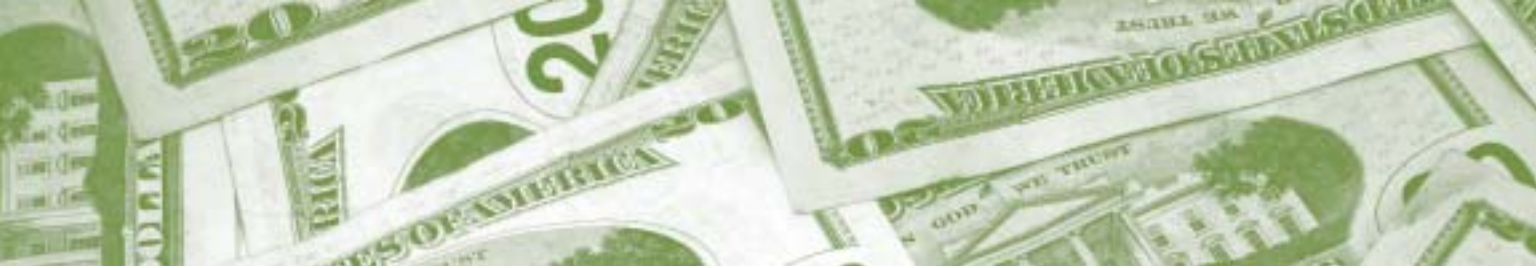
TABLE 1 Differences in Salary for ASQ Certifications